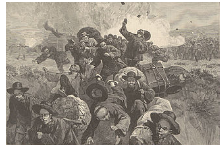
September 2: Rock Springs massacre