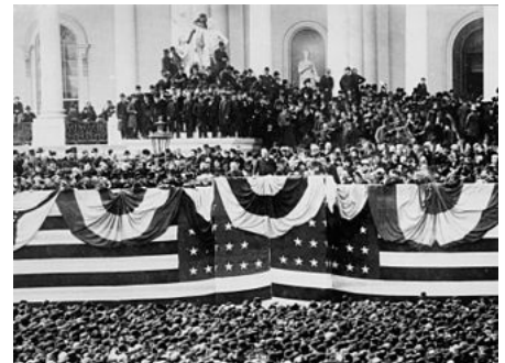
March 4: First inauguration of Grover Cleveland