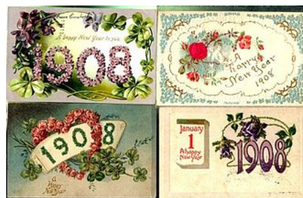
United States postcards for New Year 1908