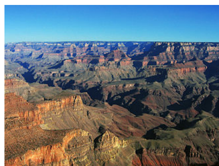
January 11: Grand Canyon designated as a monument, and later, in 1919, becomes a National Park.