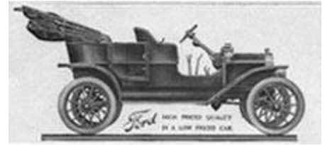
September 27: First Ford Model T.