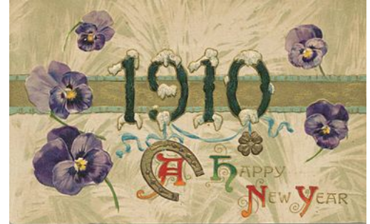
New Year's Day card