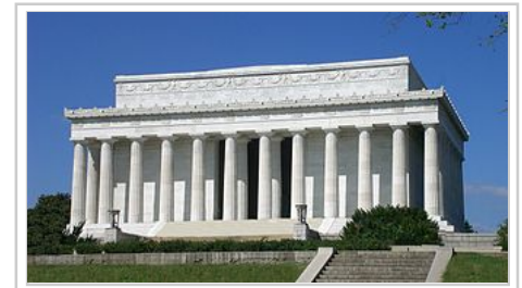
May 30: Lincoln Memorial dedicated