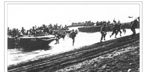
August 7: Battle of Guadalcanal begins