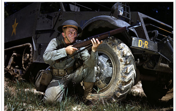
Infantryman kneeling in front of M3 Half-track, holds an M1 Garand rifle. Fort Knox, 1942.