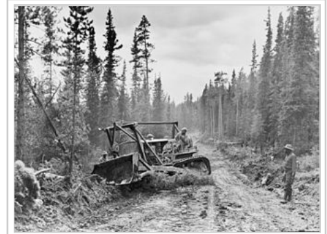
October 28: The Alaska Highway is completed.