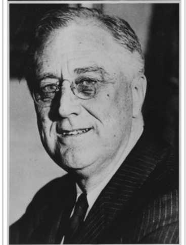
President Franklin D. Roosevelt, 1942