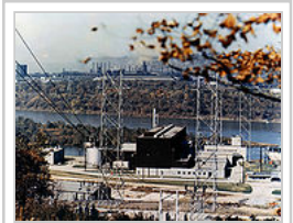
December 2: Shippingport Reactor goes online