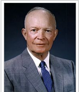
Dwight D. Eisenhower, the President of the United States, began his second term on January 20