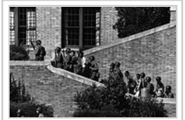
September: Little Rock Nine