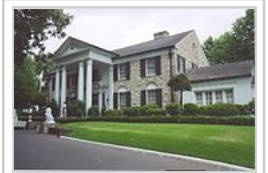
March 26: Elvis Presley buys Graceland