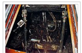
January 27: Apollo 1 fire