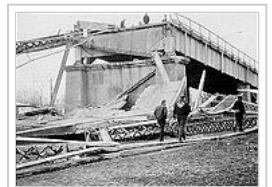
December 15: The Silver Bridge collapses, killing 46