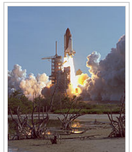
August 30– September 5: Space Shuttle Discovery's maiden voyage