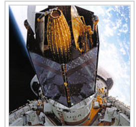
September 29: The TDRS is prepared for deployment.