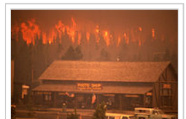
June – November: Yellowstone fires of 1988