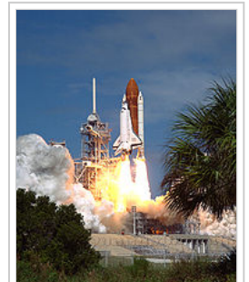
September 29: STS-26, "Return to Flight"