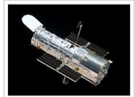
April 24: Hubble Space Telescope in orbit