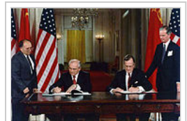
June 1: 1990 Chemical Weapons Accord