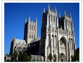
September 28: Washington National Cathedral completed