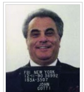
December 11: John Gotti arrested