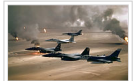
c. February: Gulf War: Retreating Iraqi forces set the Kuwaiti oil fires