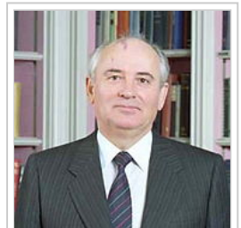
December 25: The resignation of Mikhail Gorbachev marked one of the final acts in the Dissolution of the Soviet Union