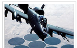
January 17: First air strikes on Iraq in the Gulf War