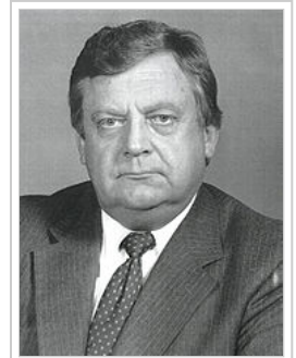
December 8: Lawrence Eagleburger becomes 62nd Secretary of State.