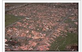
August 24–28: Hurricane Andrew