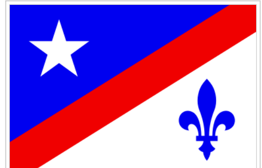
June 24: Franco-American Flag