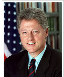
January 20: Bill Clinton begins his first of two terms as President