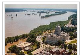
April – October: The Great Flood of 1993