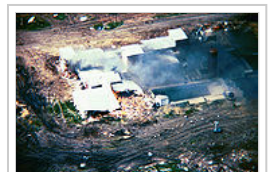
April 19: The Waco Siege ends with a deadly fire