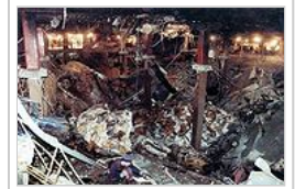
February 26: World Trade Center bombing