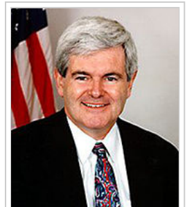
November 8: Republicans gain control of Congress ( Speaker of the House Newt Gingrich pictured )