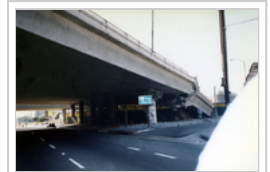
January 17: Northridge earthquake