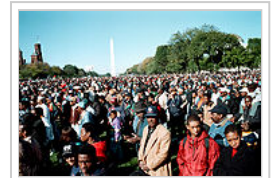
October 16: Million Man March