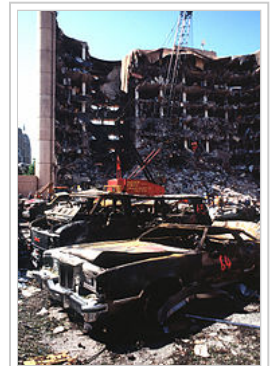
April 19: Oklahoma City bombing