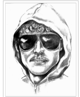
September 19: The "Unabomber Manifesto" is published