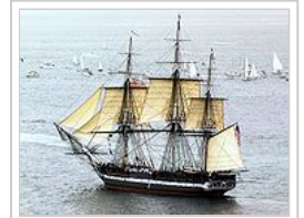
July 21: USS Constitution under sail