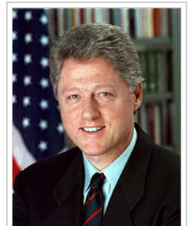
January 20: Bill Clinton, the President of the United States, begins his second term.