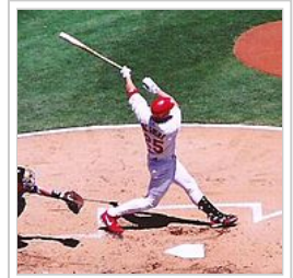
September 8: Mark McGwire breaks the single- season home run record