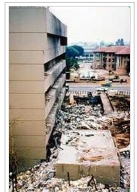
August 7: U.S. embassy bombings in Tanzania and Kenya