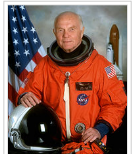
October 29: John Glenn returns to space