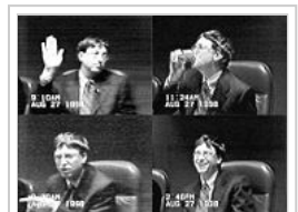
May 18: United States v. Microsoft antitrust suit (Bill Gates pictured in his August deposition)