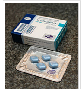
March 27: FDA approves Viagra for erectile dysfunction