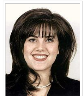
January 26: President Clinton becomes embroiled in the Lewinsky scandal