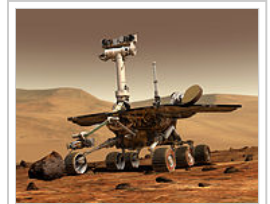
January 4 and January 24: Spirit and Opportunity land on Mars