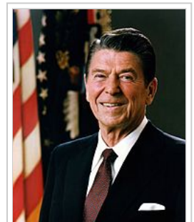
June 5: Former President Ronald Reagan dies at 93. A six day state funeral follows.