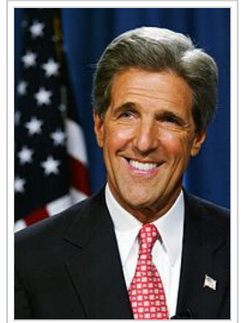
July 29: John Kerry, Democratic Presidential nominee