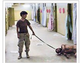
April 28: Abu Ghraib prisoner abuse revealed