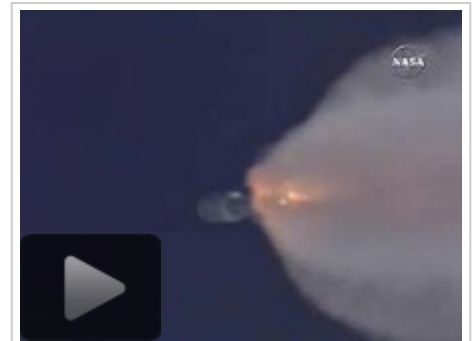
January 19: New Horizons probe launched from Cape Canaveral.