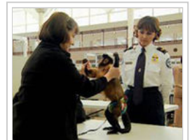
August 10: A United States TSA agent inspects a service monkey before a flight.