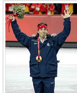
February 10 – February 26: Gold medalist Apolo Ohno at the Men's 500 meters medal ceremony.