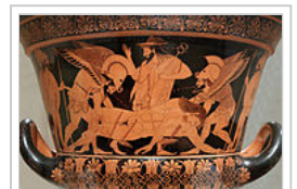
February 2: Euphronios krater.