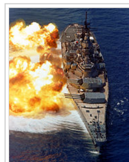
March 17: Iowa -class battleship