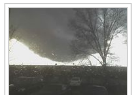
February 5 – February 6: Super Tuesday tornado outbreak