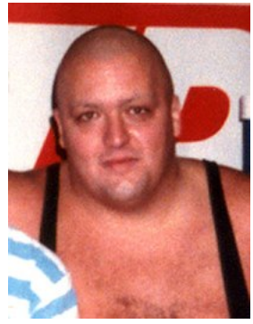
King Kong Bundy