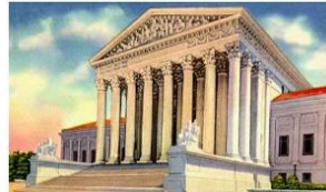
U.S. Supreme Court

States began to pass labor laws protecting workers. Child labor reached a peak in 1900 and then declined with laws requiring children to attend school.