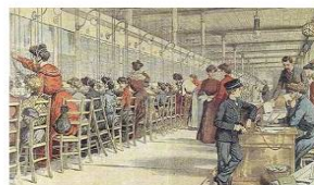
Early Telephone Operators

From male dominance to an increasing role for women starting with women's right to vote.