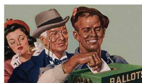
Women's increasing role

From male dominance to an increasing role for women starting with women's right to vote.