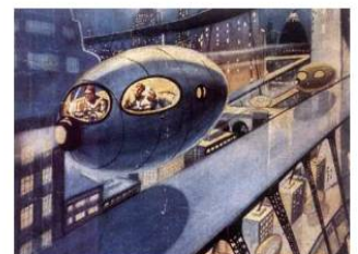
Futuristic Shuttle Circa 2030 maybe?