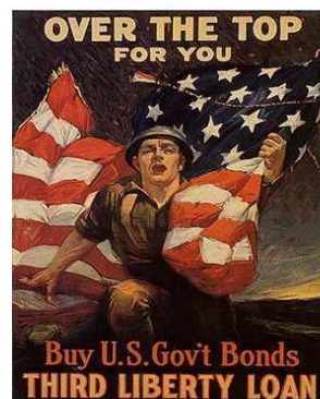
World War I Soldier