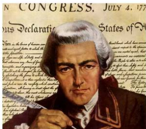
John Hancock and quill

The United States as a country became independent from Great Britain after the Revolutionary War,