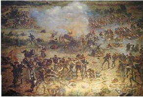
Battle of Gettysburg

fought again during the War of 1812, experienced national trauma during the Civil War and a difficult period during Reconstruction after the Civil War.