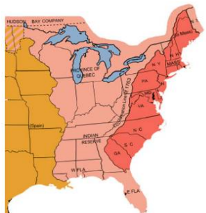
Map of the 13 Original Colonies.