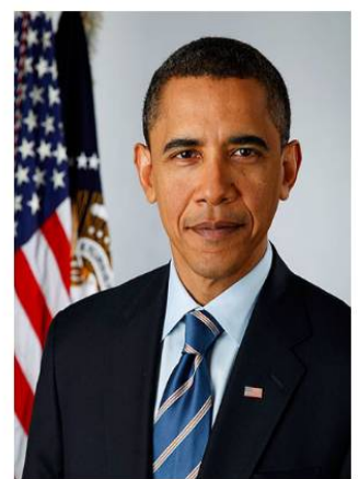
Barack Obama became our the first African American President