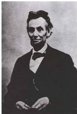
President Abraham Lincoln