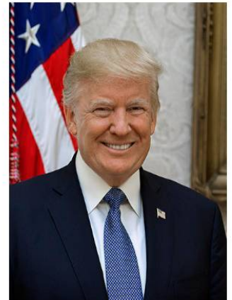
Real estate and Realty TV star Donald J. Trump won the White House in 2016.