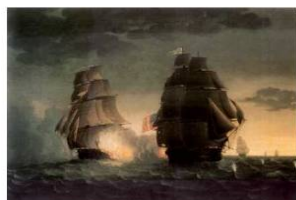
Ships: War of 1812