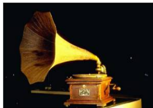
Sound recordings become mainstream with the invention of the phonograph.