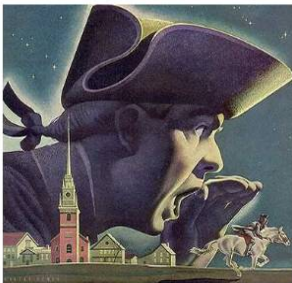
1775 Ride of Paul Revere