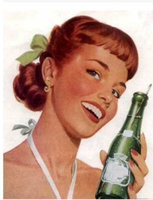
Coca Cola is invented and advertised.