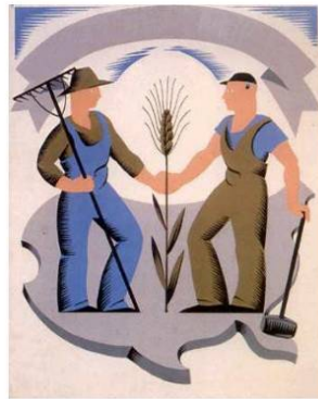
Farmer and Laborer

Racial segregation was effectively upheld by "the separate but equal doctrine" of the U.S. Supreme Court in 1896.