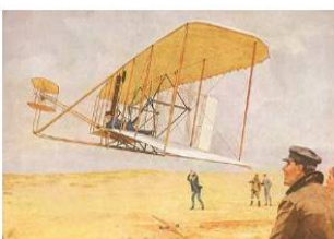
The first flights of the Wright Brothers in 1903