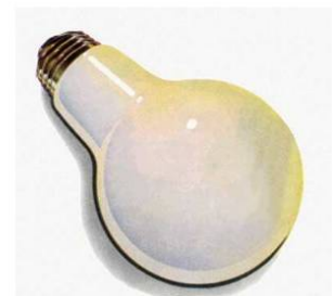
The end of the incandescent light bulb

If time travelers were to describe this period, they would mention the new habit of humans walking around with Smart Phones almost attached to the ear.