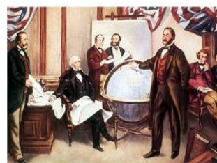
President Andrew Johnson signed a treaty purchasing Alaska from the Russian Empire in 1867.