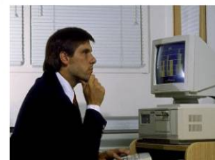
Remember Windows 95 in 1995?