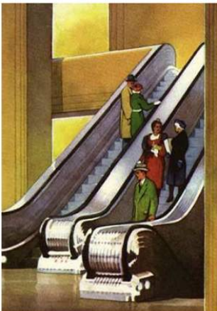
First escalator is patented in 1892