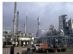
The Expansion of Industry