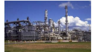
The United States headed towards energy independence