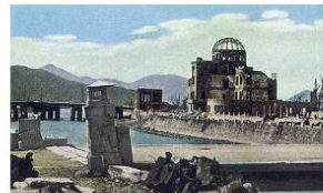
The atomic bomb was deployed to end World War II, leaving Hiroshima in ruins.