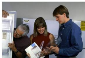
Looking at Refrigerator

This period saw great changes in American society. From Horses and carriages to cars and trucks