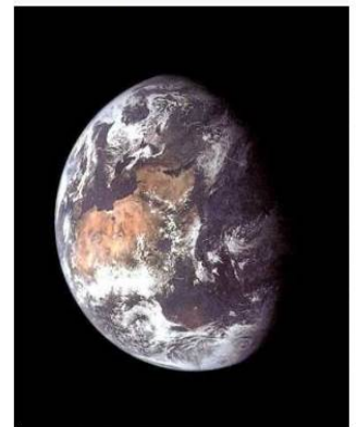
Many resolve to leave earth behind and reach the planet Mars by 2030. Is human colonization of other planets possible?