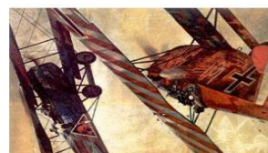
The new technology of military planes was used in World War I.

There was the war with Spain in 1898 and World War I.