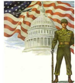
United States took a united stand against Terrorism after the 9/11 attacks

A major terror attack against the U.S. in 2001 led to the longest wars in U.S. history in Afghanistan and Iraq with the U.S. War Against Terror.