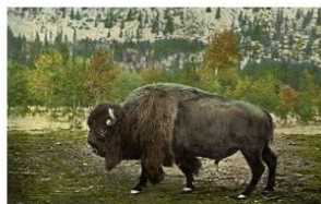
Buffalo Herds ceased to exist by 1890