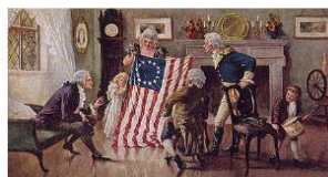
The First American flag had 13 stars for the 13th original colonies.