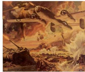
World War II, Korean War, Vietnam, and other conflicts

Communication changed dramatically with the advent of radio and later television which brought immediate news to the American public and further connected even the farthest corners of the nation.