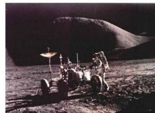
The U.S. made it to the moon in 1969