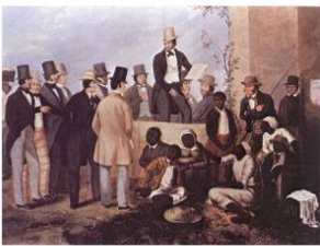
Until slavery ended in the U.S. slave auctions were common

fought again during the War of 1812, experienced national trauma during the Civil War and a difficult period during Reconstruction after the Civil War.