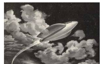
U.F.O. in flight deployed over the U.S. Capitol.