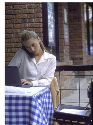
Reading the paper was replaced by the laptop lunch.

High speed internet fuels the growth of new communication services. The United States transitioned to Digital Television. Newspaper readership fell to the lowest levels in history.