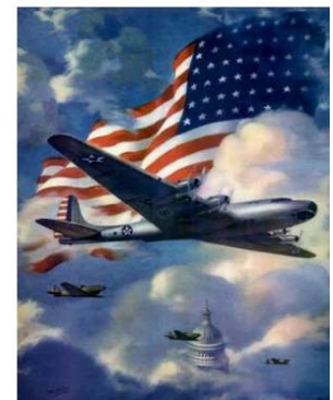
After September 11, 2001 U.S. Military planes were deployed over the U.S. Capitol.

A major terror attack against the U.S. in 2001 led to the longest wars in U.S. history in Afghanistan and Iraq with the U.S. War Against Terror.