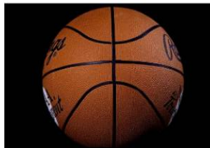
First official basketball game is played in 1892.