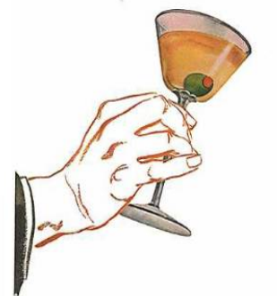
From Prohibition to the War on Drugs