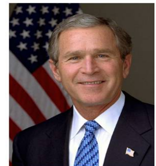
U.S. Supreme Court ruling in 2000 settled election in favor of George W. Bush.