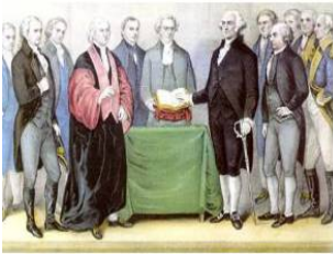
George Washington Oath of Office