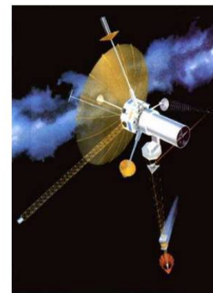
Satellites were placed in orbit for military and domestic purposes.