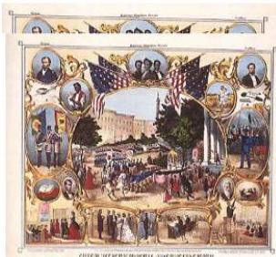
The 15th amendment formalized the end of slavery.