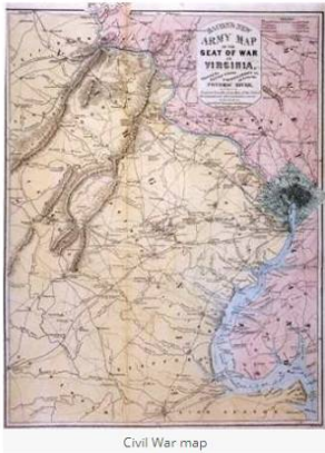
Civil War map

Due to the construction of the First Transcontinental Railroad in 1869, a trip from New York to California took less than a week instead of half a year.