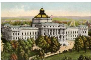
Library of Congress opens in 1897