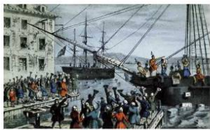
Boston Tea Party

The United States as a country became independent from Great Britain after the Revolutionary War,