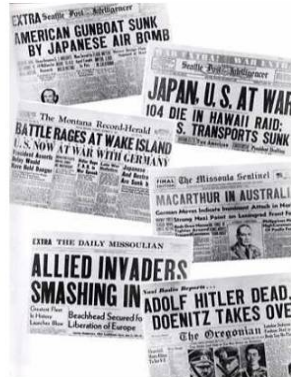
The U.S. involved in World War II

The United States participated in a number of wars. World War II, the Korean War, the Vietnam War, and various conflicts throughout the world.